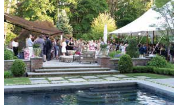
12 Annual Report 2019