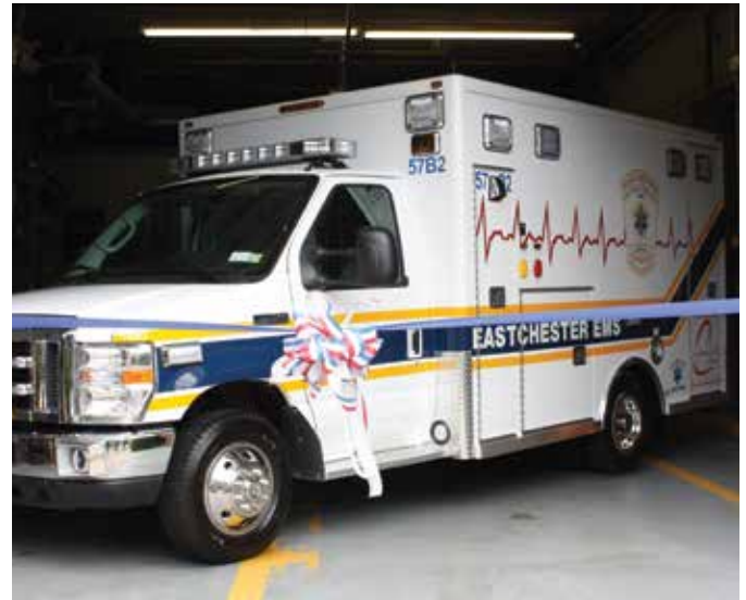
Providing funding for EVAC’s Ambulance fleet since 1999!