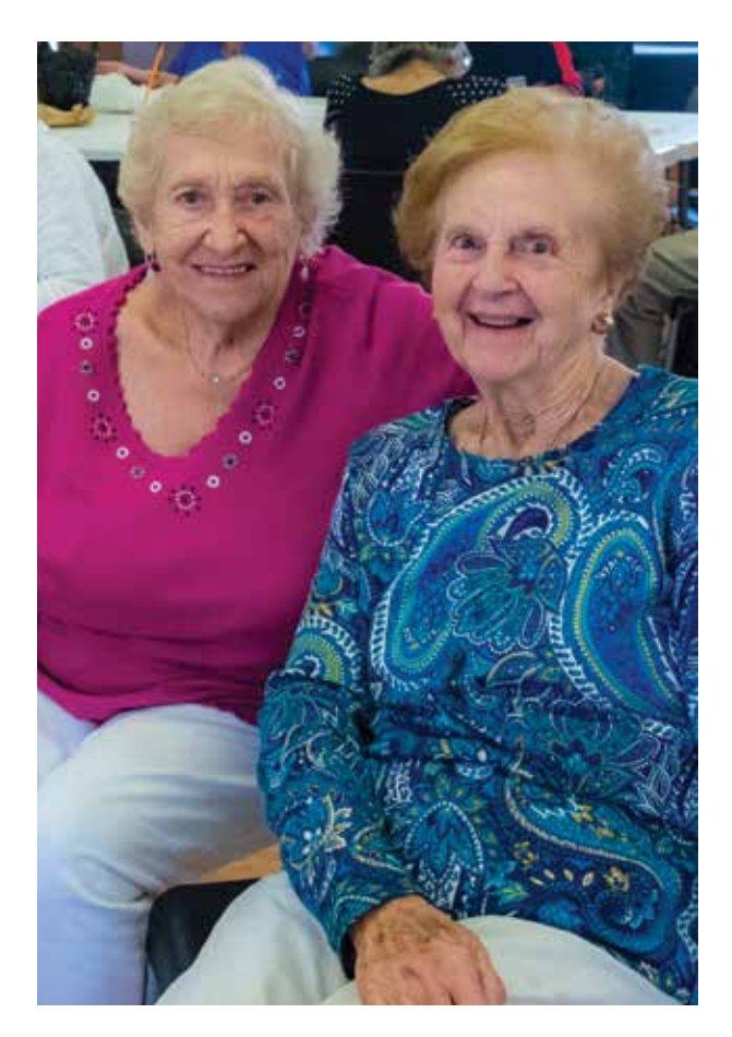
CHANNELING RESCOURCES TOWARD THE MOST EFFECTIVE PROGRAMS FOR OUR RESIDENTS AT EVERY STAGE OF LIFE.

We also set aside $25,000 for special one-time Discretionary Grants to help with a specific need or to foster a new initiative.