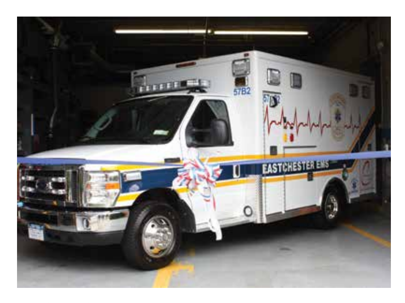
FUNDING CRITICAL RESOURCES SUCH AS STATE OF THE ART AMBULANCES.