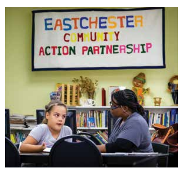
Homework help at the Books & Beyond After-School Program at ECAP

BACK INTO THE BET COMMUNITY THROUGH LOCAL NON-PROFIT ORGANIZATIONS, SOCIAL SERVICE AGENCIES AND COMMUNITY PROGRAMS.