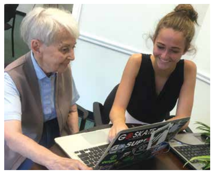
Gramatan Village volunteer teaches computer skills