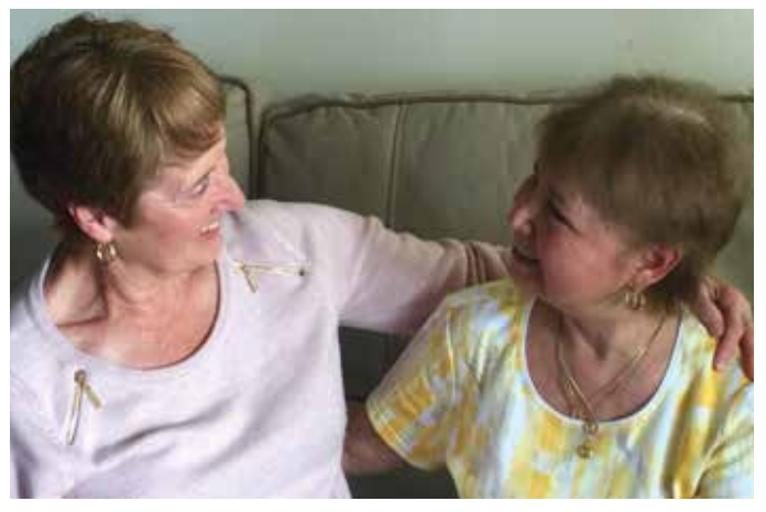
Cancer Support Team staff provides professional caring services

Cancer Support Team, Inc. – offers a comprehensive program of free services at any stage of the disease for cancer patients and their families living in lower Westchester including nursing, counseling, education, case management and other supportive services. CF dollars provide financial support for their work in the BET community. www.cancersupportteam.org