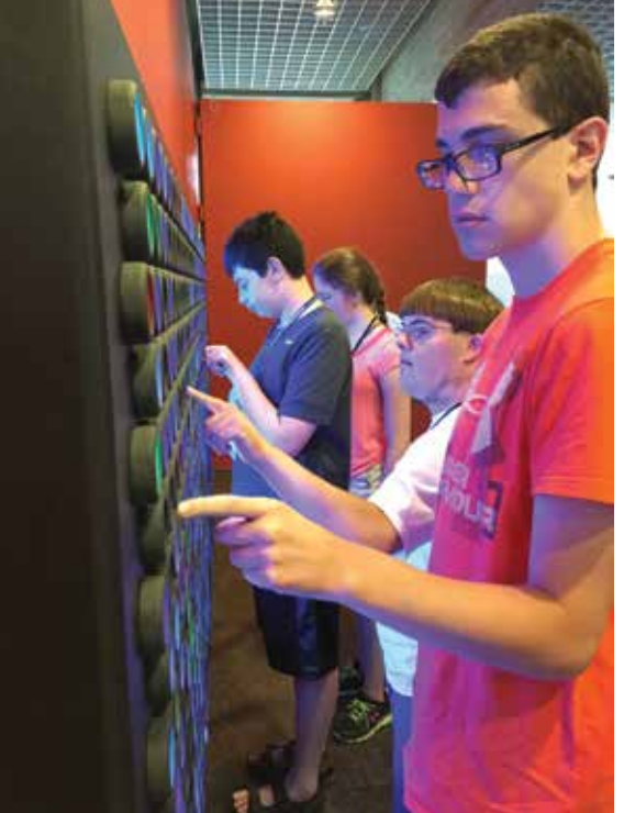
South East Consortium teens enjoy hands-on science exhibit

South East Consortium for Special Services – offers therapeutic recreational programs, leisure experiences, and respite opportunities for youth, teens and adults with disabilities and special needs. The programs are geared to enhance the individual physically, emotionally, culturally and social